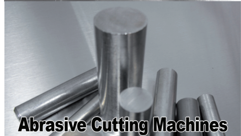
Abrasive Cutting Machines