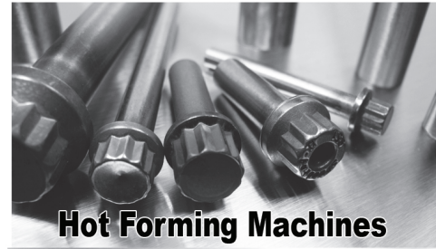
Hot Forming Machines