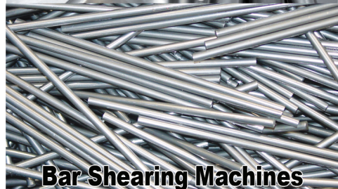
Bar Shearing Machines